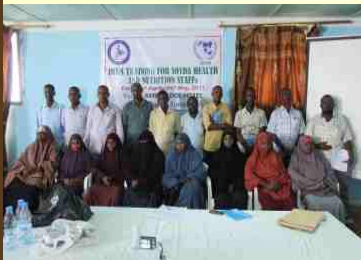
Group Photo of the participants of Course