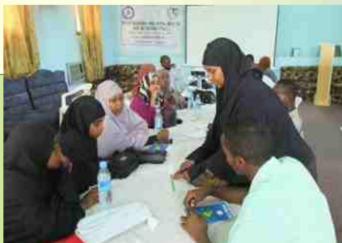
Participants during a Training session