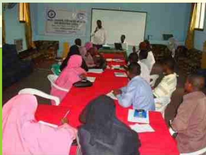
IMAM Training Participants